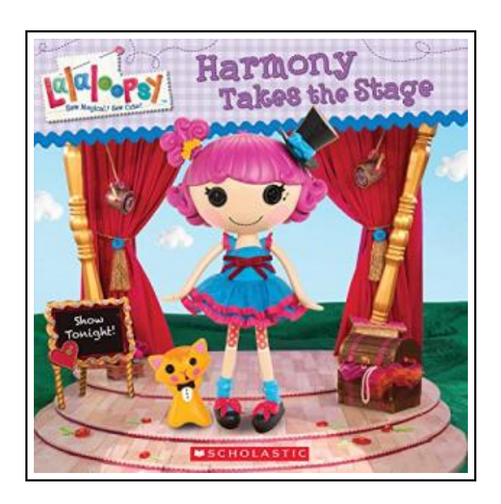
Filesize: 6.4 MB